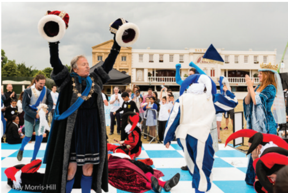
Events this summer will be similar to the Barclaycard Yes2Chess finals and live chess display which took place in Hyde Park back in the summer of 2014. Once again, Chess in Schools and Communities will be organising and there will be events for agile adults, as well as children.

The timing of the relaxation of lockdown rules has forced the postponement of the British Championships and these have been delayed to October, and will take place piecemeal in a variety of venues. The booking of the popular Riviera Centre in Torquay has been pushed back to 2022.